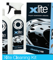
Xlite Cleaning Kit