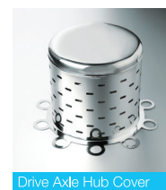
Drive Axle Hub Cover