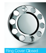
Ring Cover Closed