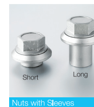
Nuts with Sleeves