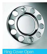
Ring Cover Open